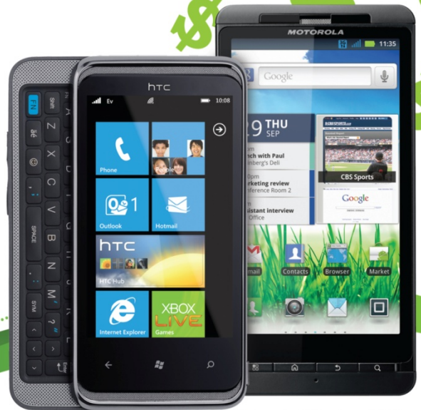
HTC 7 PRO™