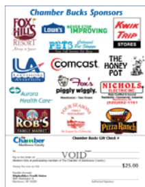
Chamber Bucks (Front)

Almost $350,000 of Chamber Bucks are sold and reinvested back into the business community each year. An increase in local spending stimulates our business economy and keeps our community alive and thriving. Visit our webpage strictly dedicated to shopping locally, www.shopmanitowocounty.com .