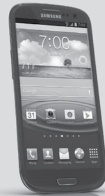
SAMSUNG GALAXY S® III

Sprint 4G LTE network available in limited areas.